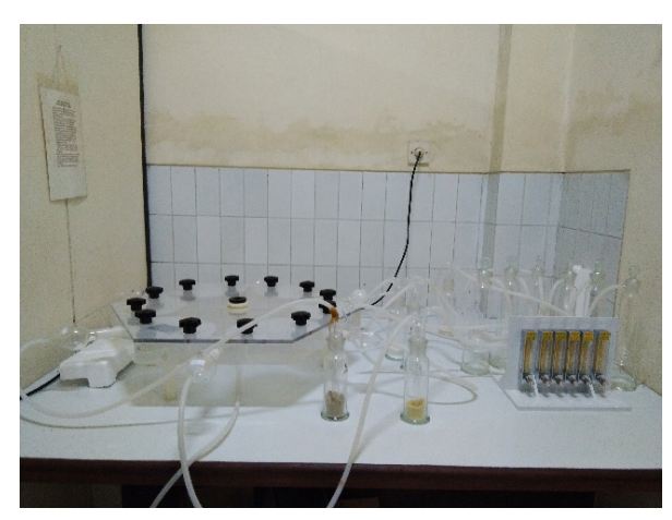
Figure 1. Six-arm insect olfactometer.